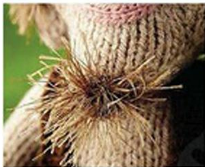
Once the troll is sewn together, use a comb to tease out the strands of fur.