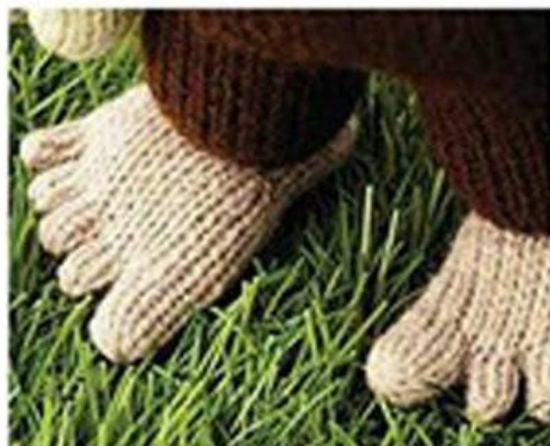
The sole and upper of the foot are worked in one piece to the toes.