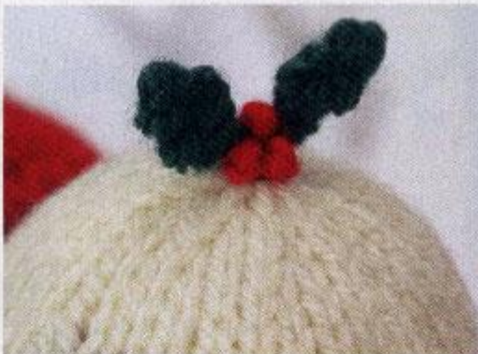
If you're not keen on French knots, use beads for the berries instead.