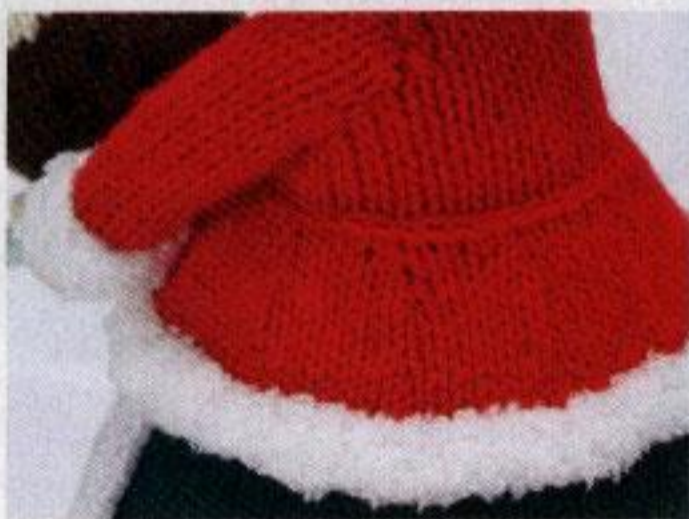
Use very neat back stitches to attach the peplum to the jacket.

Cast on 24 sts with Snowflake and st st 3 rows.