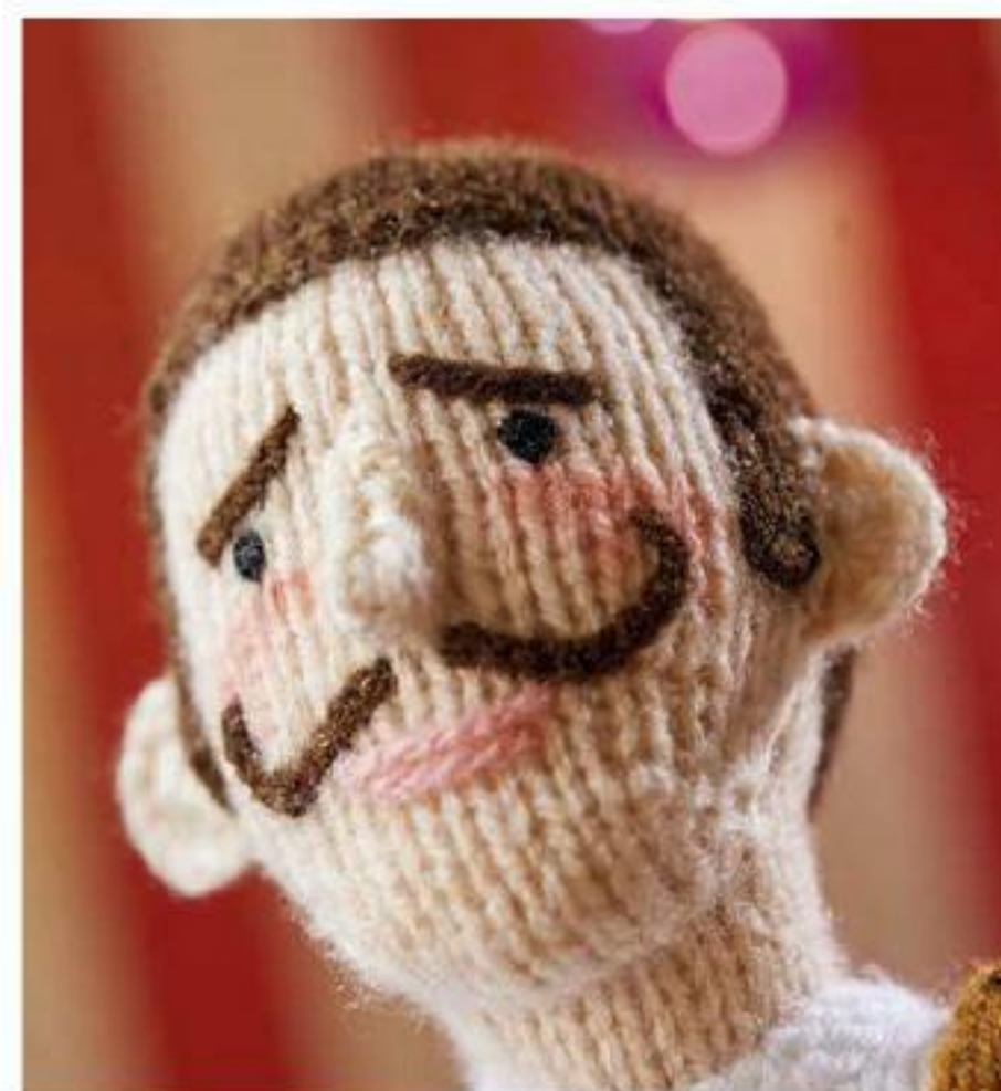
The classic eyebrows and moustache are made in Chocolate yarn and chain stitch.