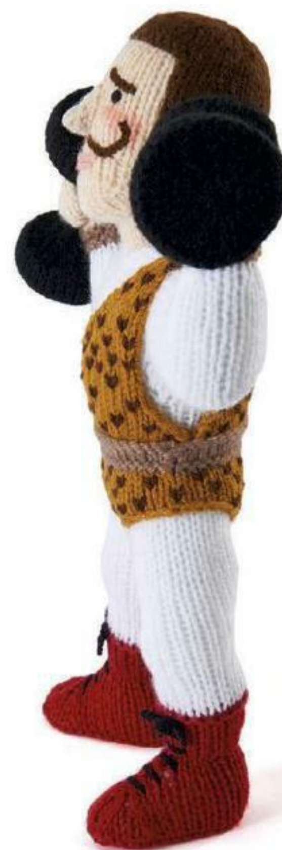
To give him balance, insert sturdy card in the Strongman's boots before sewing up.