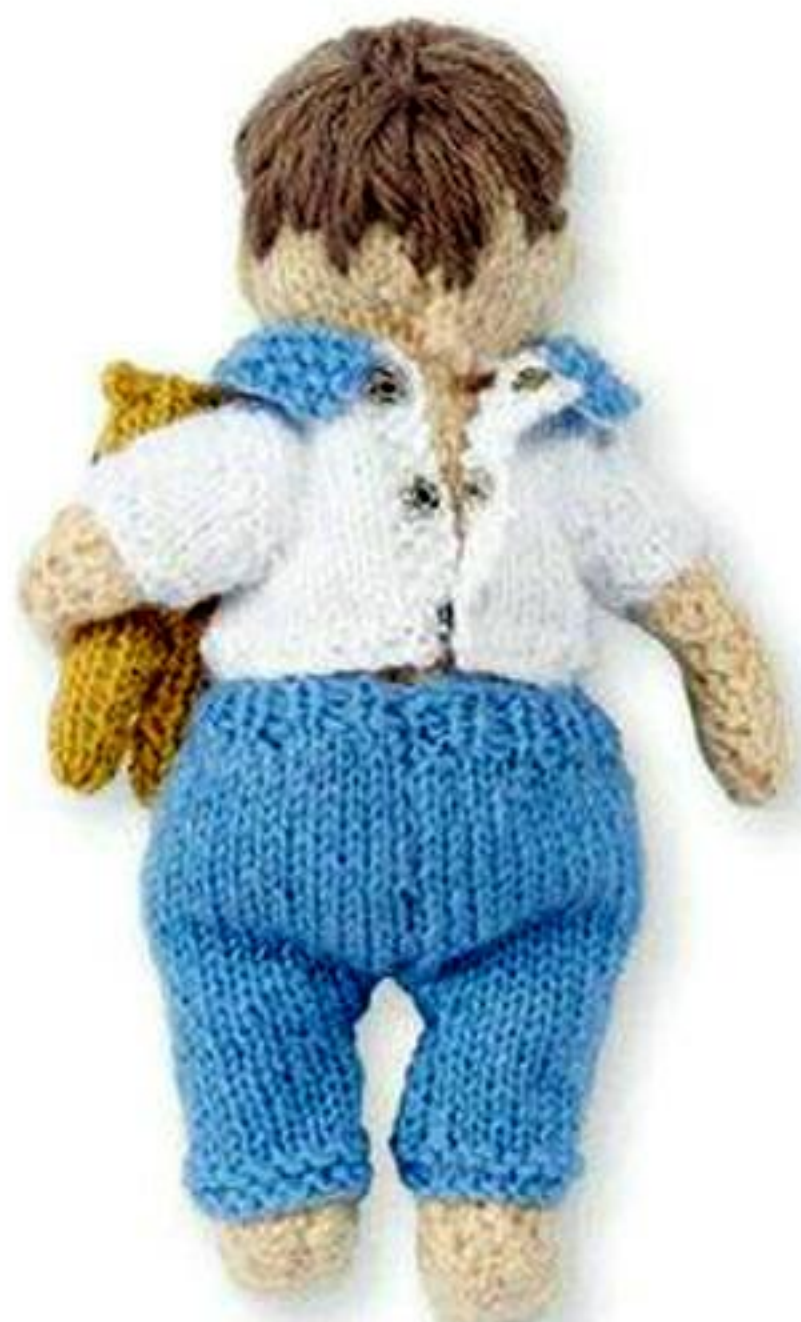
The doll's top is secured using small press fasteners sewn on to the back.

Place a couple of colour headed pins into the face where the eyes are going to be (about level with the tops of the ears). Thread a longish length of flesh coloured yarn onto your tapestry needle and knot the end. Take needle and thread in through back of neck and out to the inside side of the pins, go